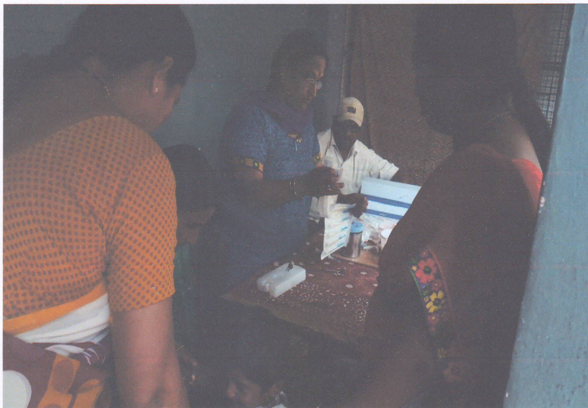
Parents are in health camp with their children