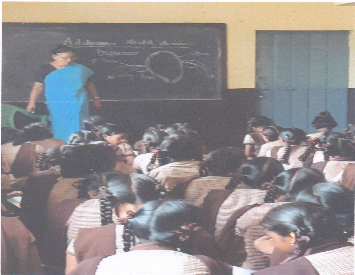
Adolescents girls in health awareness programme